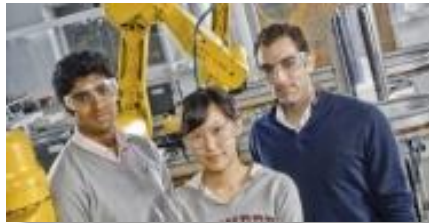
Manufacturing Engineering Tripos - MEng