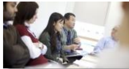
PhD and MPhil Research Degrees