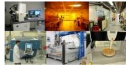
MRes and PhD in Ultra Precision