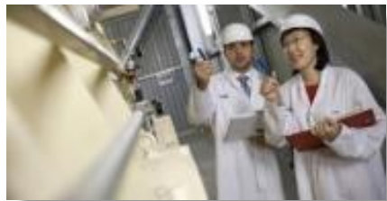
Industrial Systems, Manufacturing & Management - MPhil