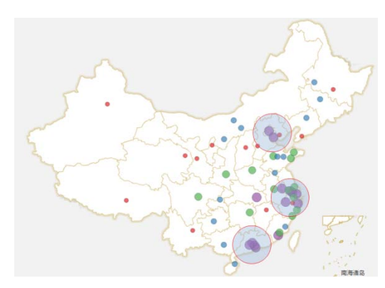
Innovation 'hot spots' in China data based on authors' own research